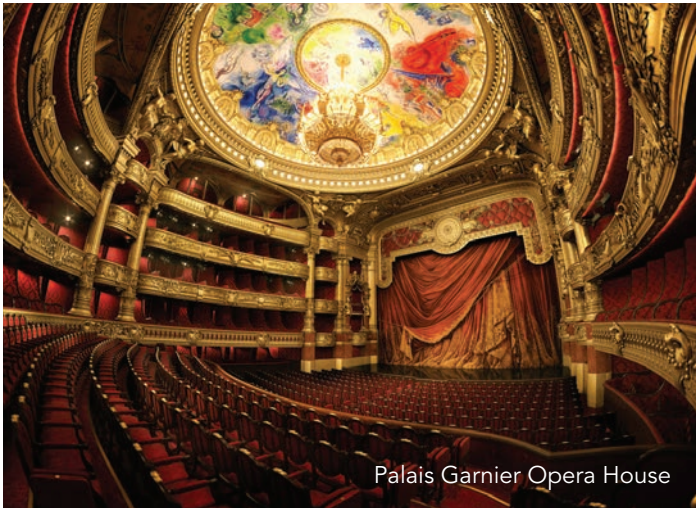
Palais Garnier Opera House