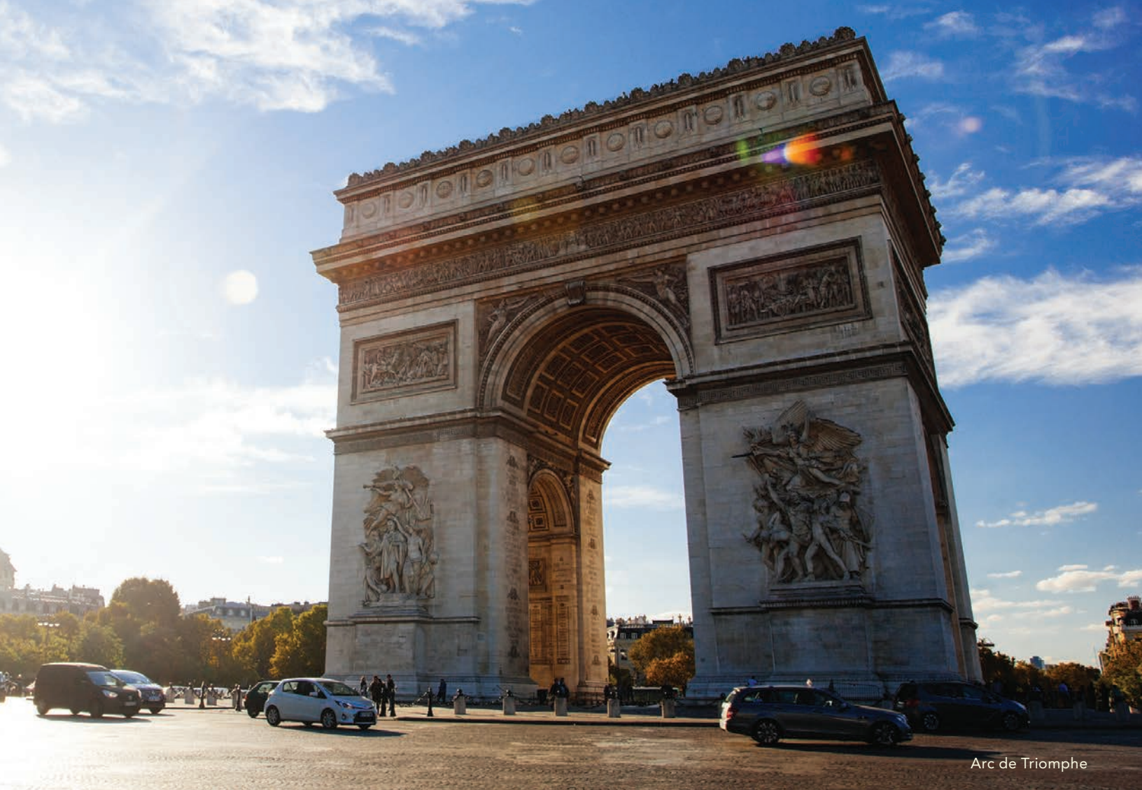
Arc de Triomphe

For more information and to reserve your space call 800-723-8454 or visit www.earthboundexpeditions.com