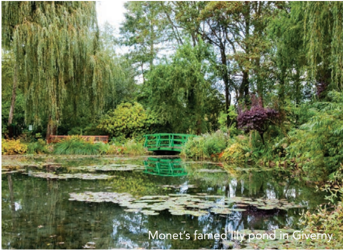
Monet's famed lily pond in Giverny

independently today and we'll meet up for an included concert tonight (or tomorrow, TBA). Sleep in Paris (B)